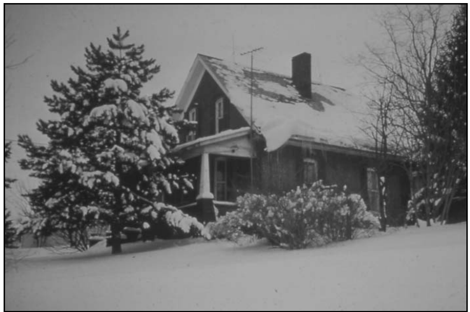
Snow dams that formed on a poorly insulated roof.

When the water reaches your eaves, which are generally the coldest part of your roof, the water may freeze again.