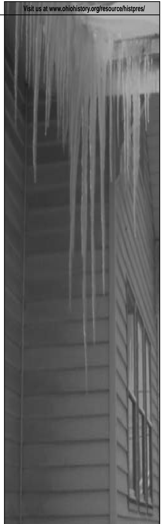
Dangerous icicles that have formed along unheated eaves.