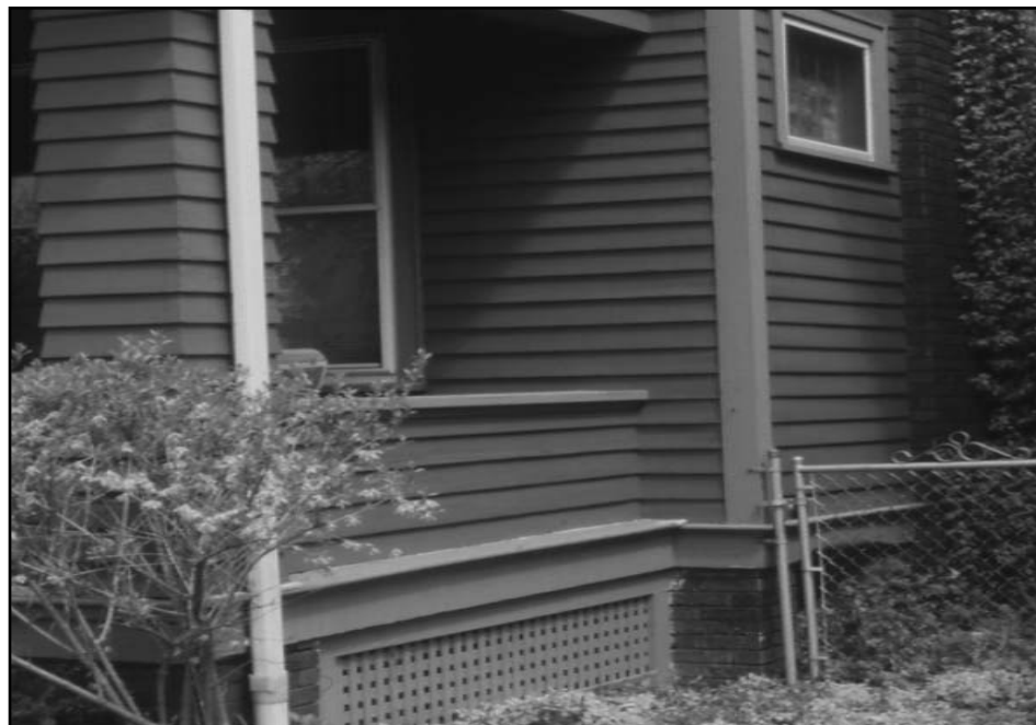
Well prepared and painted wood siding. Note how smooth the surface appears and how well paint is adhering.

Once you've completed the scraping and sanding steps, check your wood for any unsound surfaces that need to be repaired. Then lightly wash your wood surface with water and a cloth to remove dust and any surface dirt. This method of cleaning doesn't push any water into the wood, and dries quickly. Once the area is thoroughly dry, you can begin painting. Use a good quality paint brush that is recommended for the type of paint you're using. We're often asked what type of paint to use. Generally, a